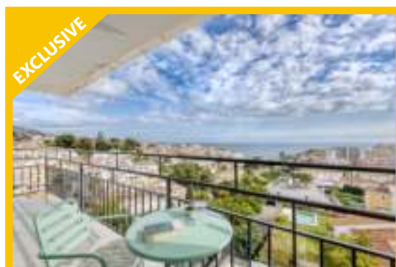
Edf. Florida, Nerja

New to the market, this fully refurbished 2 bedroom apartment offers stunning panoramic sea views from its south-facing terrace. Located within walking distance of Nerja's town center, it's part of the desirable Edf. Florida complex, with a large communal pool, gardens, and secure parking. Ideal as a full-time residence or holiday rental investment.