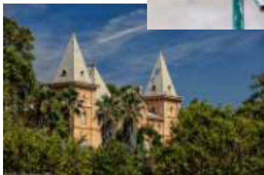
Part 2 in the June magazine