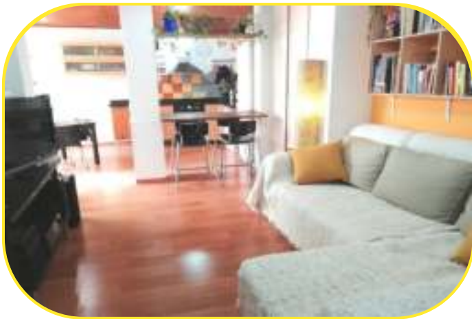
VSR4109 CENTRE OF NERJA Currently 2 beds and 2 offices can be easily converted into a 4 bed apartment. Private patio and 2 bathrooms, close to the Balcon de Europa. Price:- €280.000 Book a viewing now!