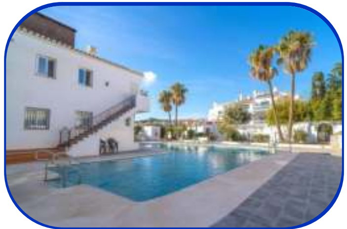
VSR2203 NERJA Apartment, 100m2, quite different, all open plan, unfurnished, air con, shower room, 1 bedroom, communal pool, lots of potential and space. Price:- €199,500