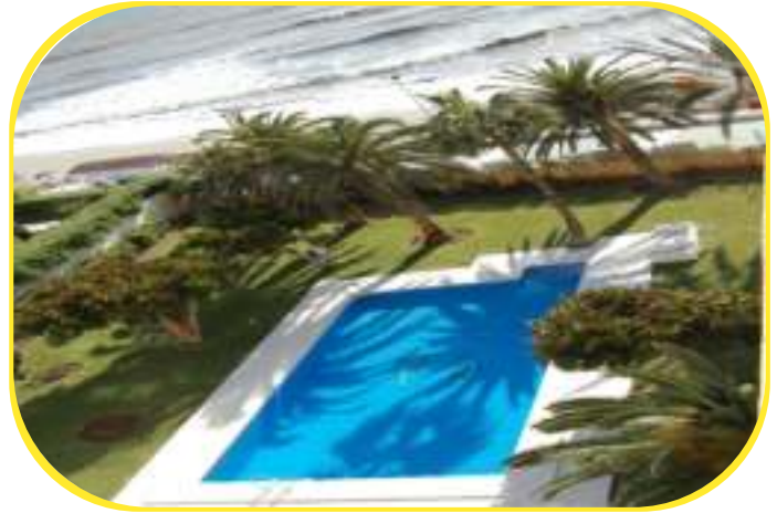
VSR4115 TORRECILLA AREA Studio apartment, 38m2, close to the beach, glazed in terrace, with views to the communal pool and gardens, a/c, great rental potential. Price:- €200,000 Book a viewing now!