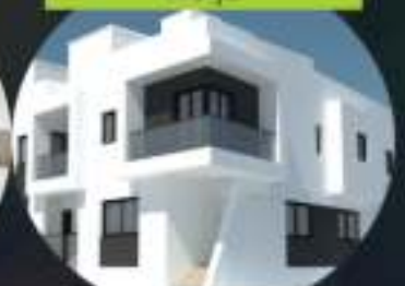
Town House Nerja