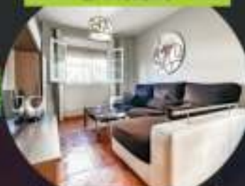
Apartment El Morche