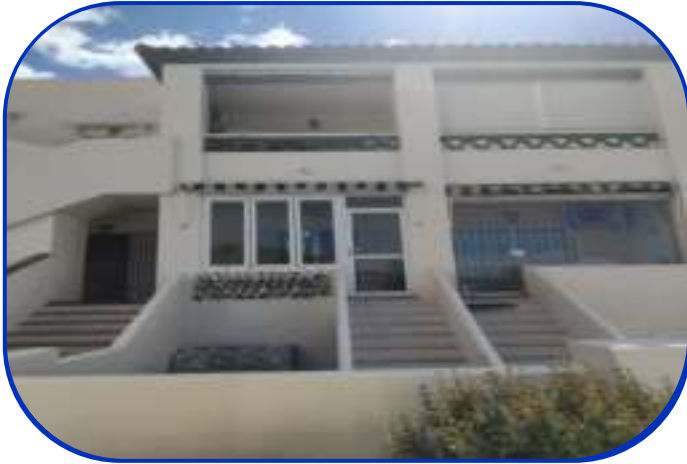
VSR2022 EDIF. TOBOSO Apartment two bedrooms, bathroom, large patio, sea views, close to Playazo Beach. Price:- €320,000